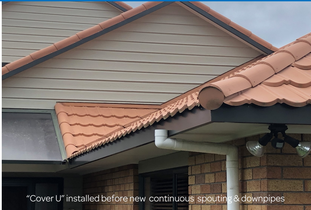
"Cover U" installed before new continuous spouting & downpipes