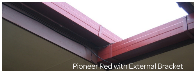
Pioneer Red with External Bracket