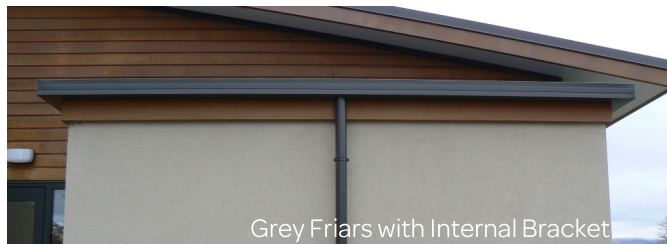
Grey Friars with Internal Bracket